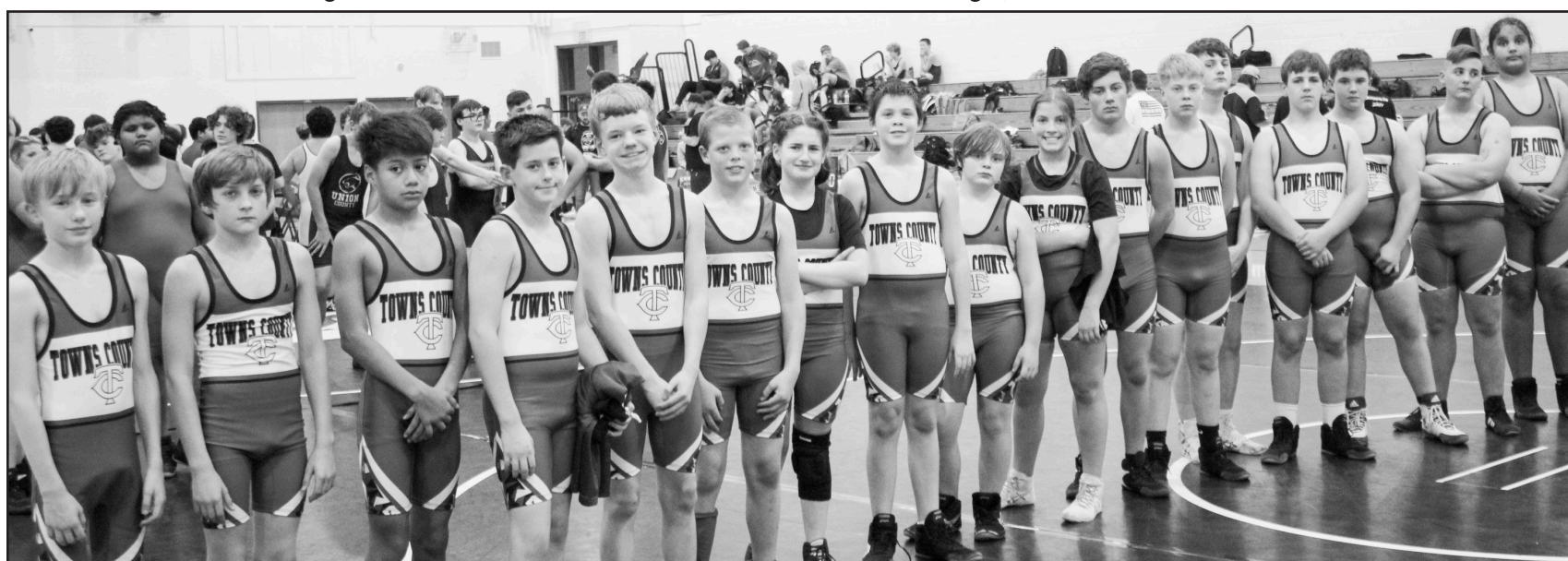
Towns County middle school wrestlers during the recent King of the Mountain tournament.

While this was the first match of the high school season, the middle school wrestling team has been in full swing for